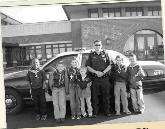
DEN 2 VISITS HUNTLEY PD